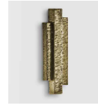
Antique brass with deco detail