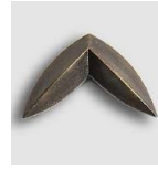
Bronze with leaf detail